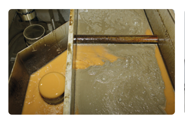
Industrial wastewater is often heavily polluted with oil, fat and heavy metal salts. It is not allowed to be disposed of into the public sewer system without treatment.

Some substances cannot be completely separated by this principle. Thus the distillate of conventional evaporators is often turbid and of poor quality, requiring post treatment. In recent years we could introduce many innovations setting benchmarks on the market regarding optimization of the separation process. Thus the VACUDEST process, compared to other conventional evaporators, guarantees crystal clear distillate with outstanding quality. Our Clearcat- and game-changing Purecat-technologies for instance allow COD reduction (COD: Chemical oxygen demand, a measurement for the degree of pollution with organic substances) of up to 99 percent. Your investment in a trend setting VACUDEST vacuum distillation system is your guarantee for excellent distillate quality.