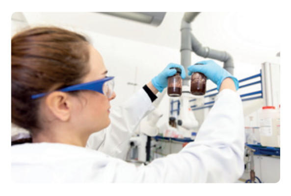
We analyze your industrial wastewater. Based on the results we develop the best solution for your individual requirements.