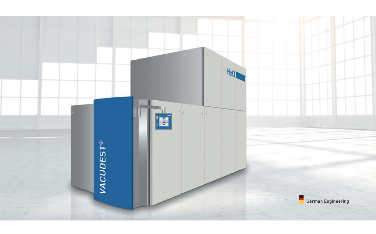
VACUDEST. The Effective Distillation System.