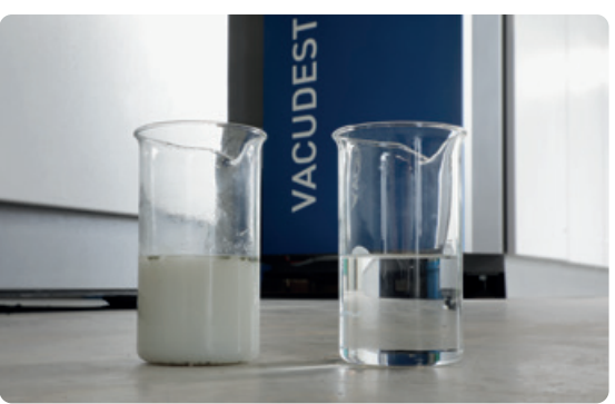
Using VACUDEST vacuum distillation systems you can process your industrial wastewater simply and efficiently. The quality of the produced distillate sets benchmarks and meets strictest environmental standards.